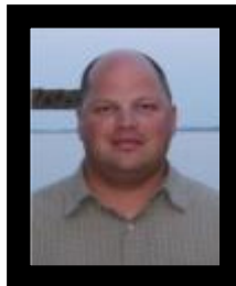
Chris Fortner Marketing